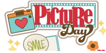
Photo Day has been rescheduled to WEDNESDAY, FEBRUARY 10 th for the SK Graduation Class, Grade 8 Graduation Class and for any students that missed the first photo day in November (including those students that were Remote Learners). Please note that there will not be any re-takes or sibling photos this year.

http://scholastic.ca/canadaclubs/why-clubs/why-reading-club-home.php